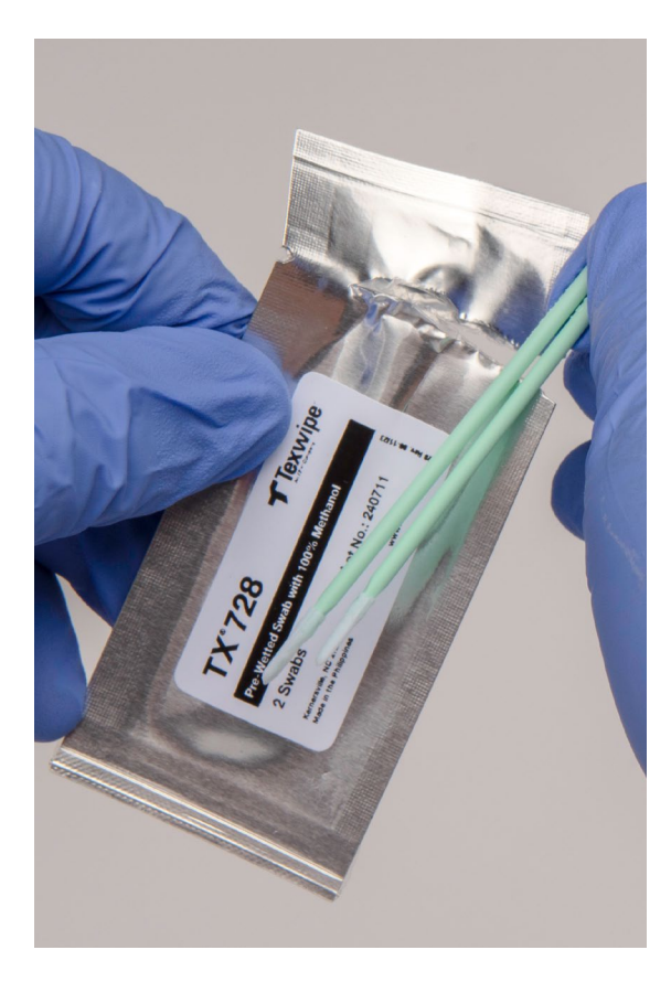
Two swabs per metal single-use pouch.