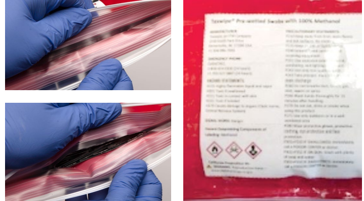
Resealable red slider bag with GHS labeling on back.

Texwipe holds an ISO 9001:2015 registration. All Texwipe products conform to GHS classification for labeling (where applicable). Shipping classification based on weight of inner package.