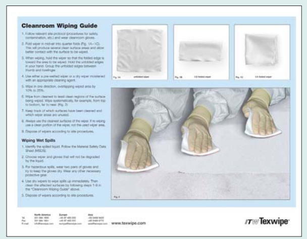
Figure 4. Wiping Guide

The wiping action puts the fabric in intimate contact with the surface, allowing the application of strong forces for the removal of contaminants such as bioburden. Wiping has a long and successful history for removal of contaminants from cleanroom surfaces. However, to be successful, the wiper must be used properly. The table below addresses the primary concerns in the use of wipers and mops for critical cleaning and provides corresponding best practices with explanations. This information is also summarized in the wiping guide ( Figure 4 ).