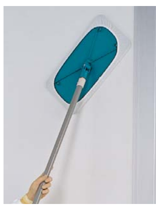
Figure 2. Flat surface mop for ceiling, wall and floor cleaning

The USP <797> document requires that floors in the background environment (also termed "buffer or clean area") be mopped daily, while walls, ceilings and shelving are to be mopped monthly. To accomplish these tasks most effectively, the following procedure, utilizing a single flat mop ( Figure 2 ) with replacement mop covers can be employed.