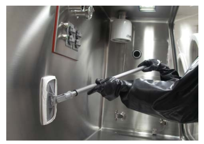
Figure 1. Isolator cleaning tool in use

To ensure that each shift begins in a pristine environment, it is necessary to clean the isolator to remove any residues and soils produced from the prior shift's activity. These contaminants, if not removed, would otherwise unnecessarily consume disinfectant and mitigate its application.